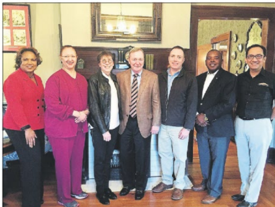
SPECIAL | HPE

Previous citizens of the year awarded him this special recognition. The award is kept secret until today, when it is announced here on the front page of this newspaper.